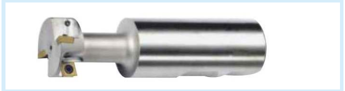
TDS T型溝銑刀 T-slot milling cutter