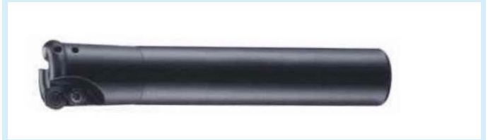
AP 直柄圓刃銑刀 Straight shank round insert milling cutter