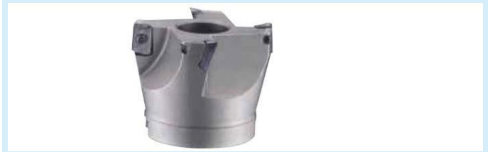
R390 殼型直角銑刀 Shell type shoulder cutting milling cutter