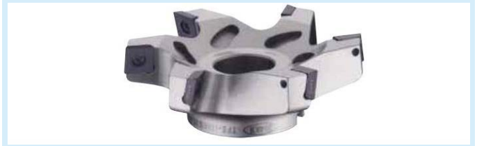
TFE 輕量化殼型銑刀 Light duty shell type milling cutter