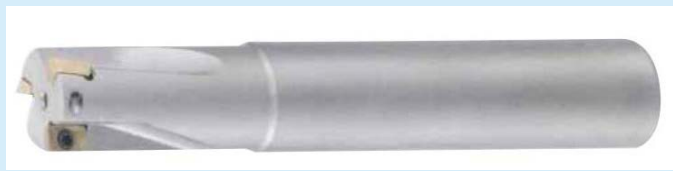
X0 高速直角銑刀 Shoulder cutting high speed end mill