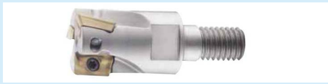
R390 連接式直角銑刀 Connection type shoulder cutting milling cutter