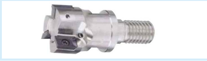
AP 鎖牙式直角銑刀 Threaded shoulder cutting end mill