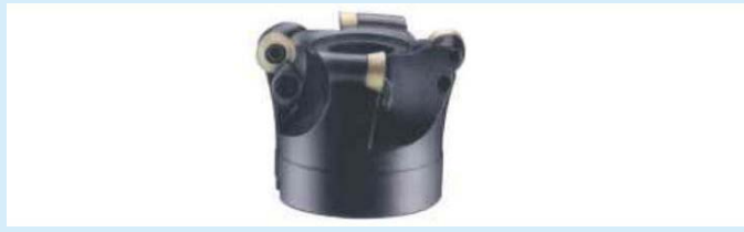
RP 殼型圓刃銑刀 Shell type round insert milling cutter